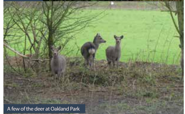
A few of the deer at Oakland Park