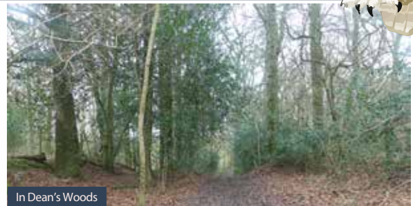
In Dean's Woods