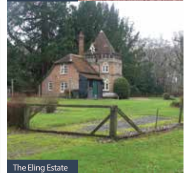
The Eling Estate